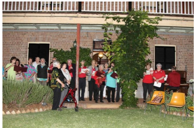
TCS joined by other guests for a community carol sing.