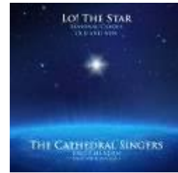
Lo! The Star