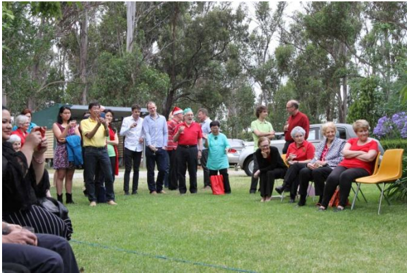
TCS members in awe of the spectacular show