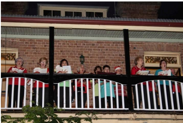
Singing from the balcony