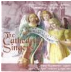
The Cathedral Singers