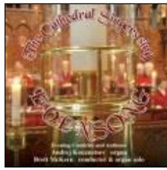
TCS Sings Evensong