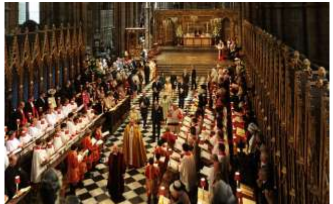
Westminster Abbey at the Diamond Jubilee

The Prologue was "Nimrod" by Elgar and the choir and Sanctuary party processed to "Thy hand, O God, has guided..." and the congregation joined in with enthusiasm for the British National Anthem (three verses) and in the later tributes of "I vow to Thee my country..." and "Jerusalem". Other music and prayers reprised the service last year for the Queen's Diamond Jubilee celebration which in return recalled the Coronation of 1953 with Zadok the priest and special prayers.