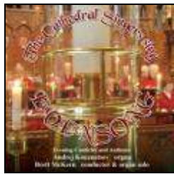
TCS Sings Evensong