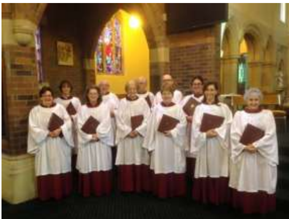
At St Mary Magdalene Rose Bay