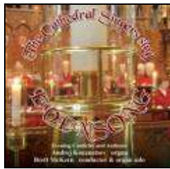
TCS Sings Evensong