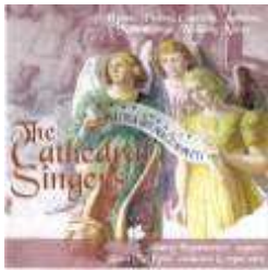
The Cathedral Singers