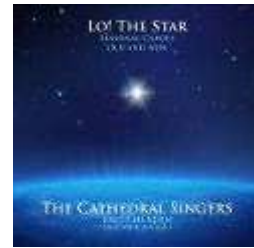
Lo! The Star