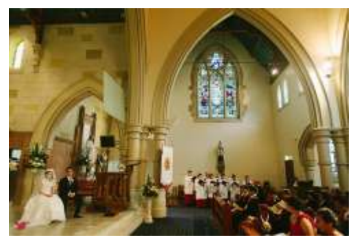
TCS at Our Lady of the Sacred Heart, Randwick June 2012