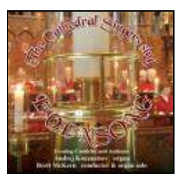
TCS Sings Evensong