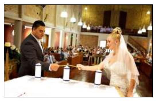
At Santa Sabina - January 2013