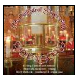
TCS Sings Evensong