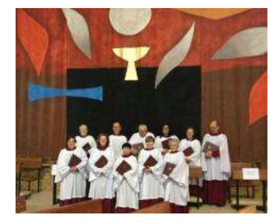
The Cathedral Singers in Bathurst