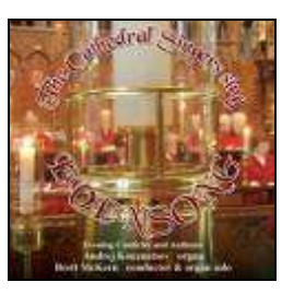
TCS Sings Evensong