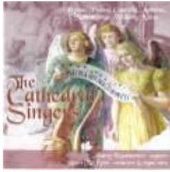
The Cathedral Singers