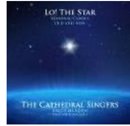
Lo! The Star