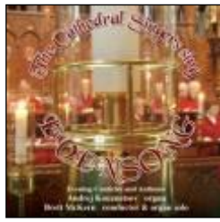
TCS Sings Evensong