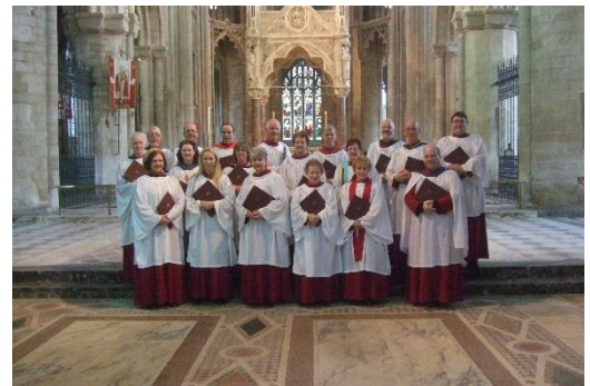
TCS at Peterborough Cathedral 2011

The article spoke about the importance of music in services and why cathedrals in England may be more popular than parish churches "Music is very important, evensong is the most important service, people go for the music. They (cathedrals) don't feel obliged to be religious. I think the churches, particularly cathedrals are responding to people's desire for something that might be called spiritual. They are meditative, they are buildings where people find peace. They find peace in the music and the spirit."