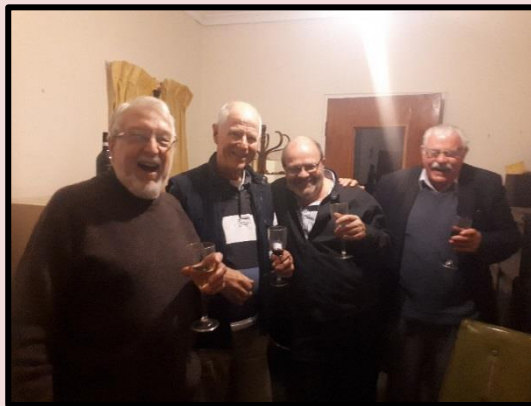
We men take our singing seriously!!!

Your donation is free! What could be better at this time of year??