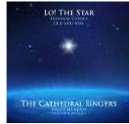
Lo! The Star