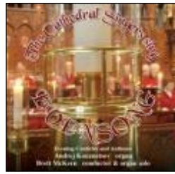
TCS Sings Evensong