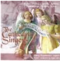
The Cathedral Singers