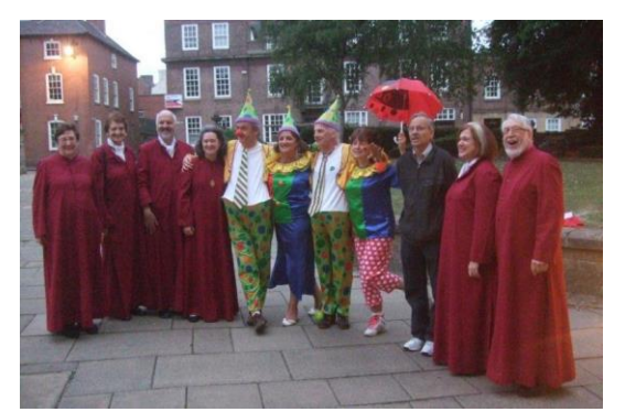
Fraternising with the locals outside Leicester Cathedral - 2011